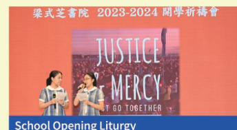
School Opening Liturgy