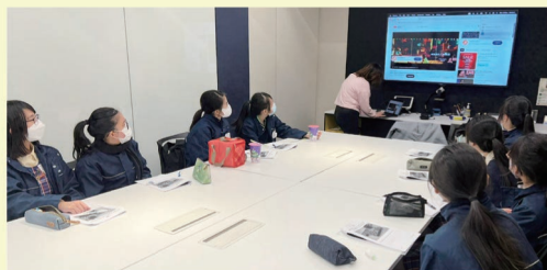
An inspiring time together