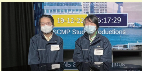
Learning to be a journalist