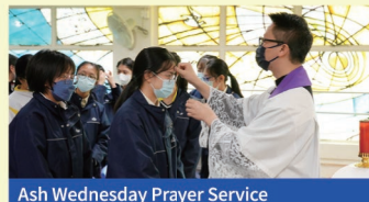
Ash Wednesday Prayer Service