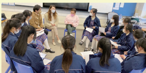
Great things happen with teamwork